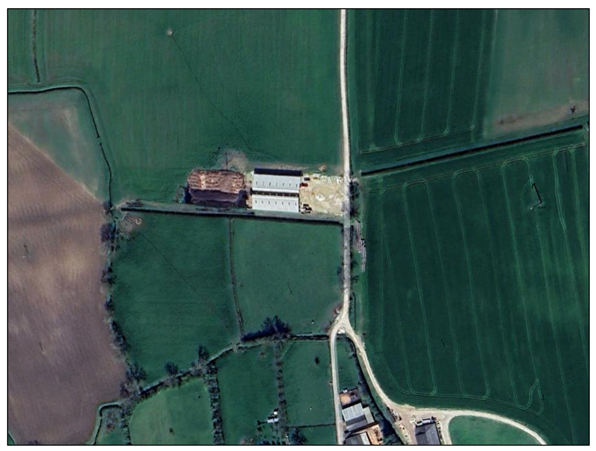
Fig. 3 – Aerial imagery

The proposed cable route identified by the option area shown edged red in Figure 2 is the result of between 12 and 18 months negotiation with NGET's representatives to avoid a solar park currently being developed on our Client's land and also to align the route to the south side of the new agricultural buildings which can be seen on the Figure 3 above.