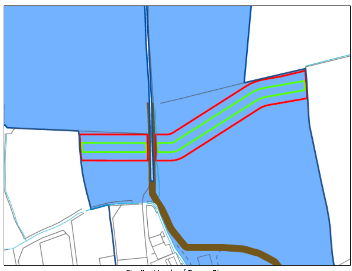
Fig. 2 – Heads of Terms Plan