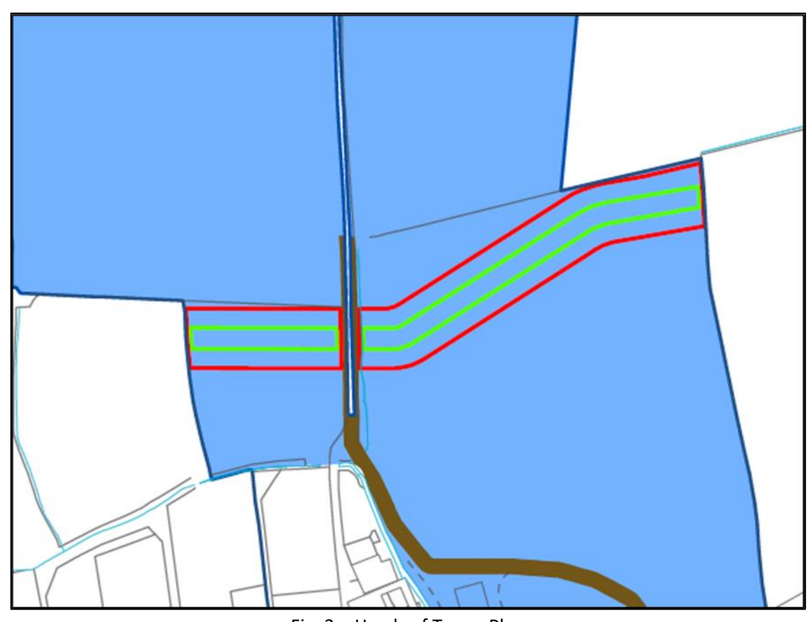
Fig. 2 – Heads of Terms Plan